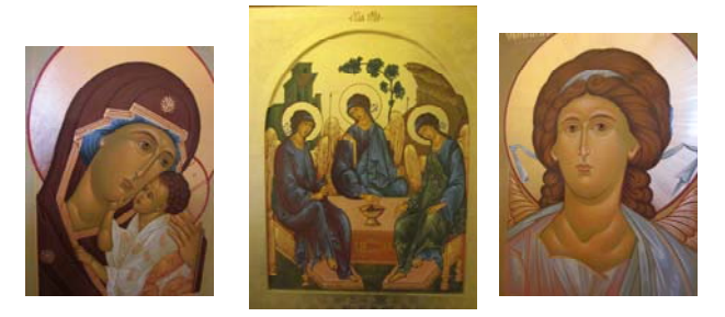
Icons Displayed at Exhibit-photos taken by Gini Pudlo

The Museum is open until 8:00 p.m. on the first Thursday of every month.