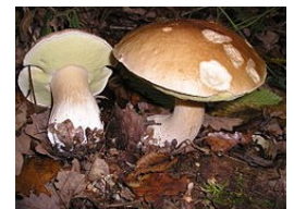
Borowik (King Bolete)

Because they're harmful or are evil-flavored. They are not useless but for beasts are good, Shelter the insects and adorn the wood. They stand upon the grassy cloth in order Like rows of plates: such as with scalloped border The small leaf mushrooms, silver, red and gold Like goblets that all kinds of liquor hold; The kids like swelling cups turned upside down; The funnels slim like champagne glasses grown; The kind called white that broad and flattish gleam Like china coffee cups filled with cream.