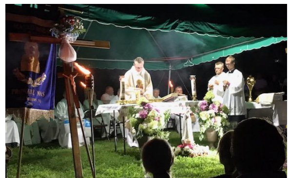
Outdoor Mass Under the Stars