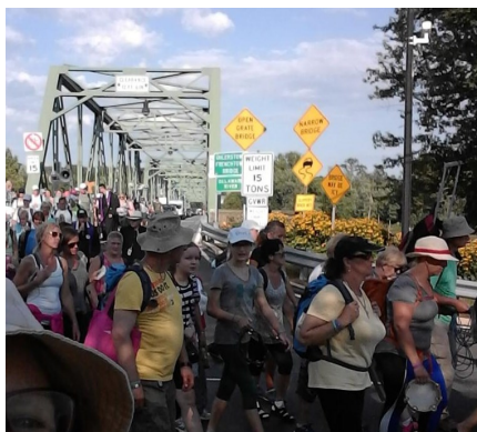
The Line of Walking Pilgrims Stretches Beyond Sight

Upon reaching our destination at the Shrine in Doylestown, Mary, Our Mother, Our Queen, welcomes the weary and joyous pilgrims. Our group from Great Meadows swelled to 2,800 pilgrims this year upon entry into the Shrine. Many suffer physical pain along the way, but it is all worth it once we arrive at our Mother's House. I share this same information with my co-workers each year upon my return: “It was grueling yet glorious at the same time.” As one friend responded, “It's a long walk to Church.” Yes it is, but one I plan to repeat as many times as I can. The invitation is open to anyone who wishes to join me next year.