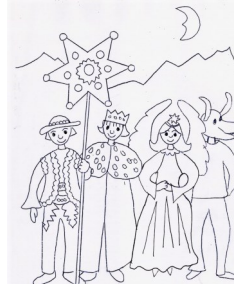
It's Poland to go about carol-singing from house to house is still popular. The carolers carry a large star, wear costumes of King Herod, an Angel, David, Joseph, Wild-Go etc. Caroling begins on Christmas Eve and in some areas continues to Candlemas Day, February 2.

We will also have copies available at Szopka.